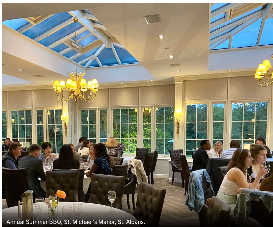
Annual Summer BBQ, St. Michael's Manor, St. Albans.

A final mention and gratitude to our sponsors who made the event possible, Moore Kingston Smith St Albans office and Insite Public Practice. Lastly a thank you to those who organised and supported the event.