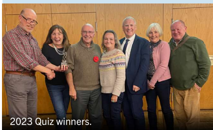
2023 Quiz winners.

To find out more and book your place head to https://events.icaew.com/pd/29435 .