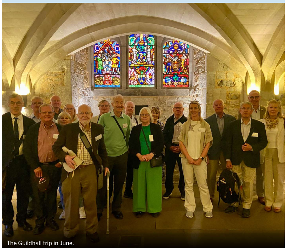
The Guildhall trip in June.

We are in the process of organising trips for 2025 so please let us know of any ideas you may have.