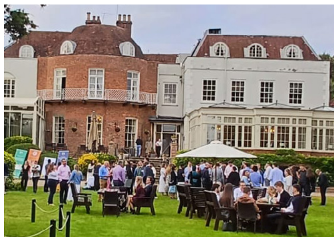
A rain-free evening

Thanks are due to local firms, Moore Kingston Smith in St Albans and Foxley Kingham in Luton , along with recruiters FIRE in Watford who supported the event.