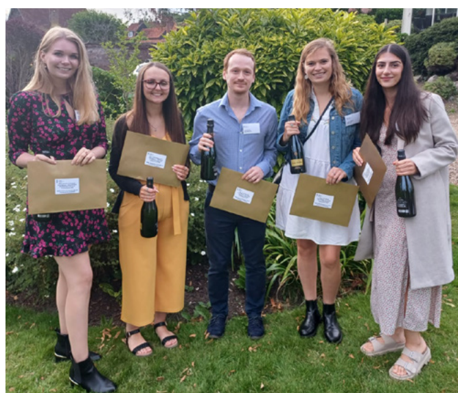
Prize winners for their achievements in the recent ICAEW Professional and Advanced Level exams