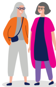
HEALTH & CARER SUPPORT