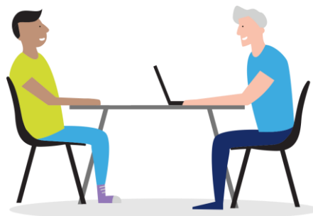
CAREER DEVELOPMENT SUPPORT